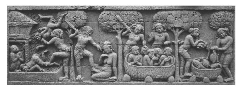
Figure 2.3 Punishment in Hell

reliefs well beyond the Indian subcontinent, namely the panels of the Borobudur st\bar{u}pa in Java. <sup>109</sup>