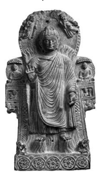
Figure 2.1 The Twin Miracle

The stele shows the Buddha performing the twin miracle, which requires the simultaneous manifestation of fire and water emerging from different parts of one's own body, 11 an expression of complete mastery over these material elements. In the above stele fire can be seen to emerge from the Buddha's shoulders whereas water flows from his lower body.