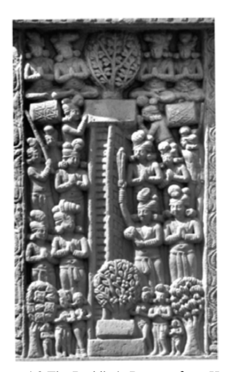
Figure 4.2 The Buddha's Descent from Heaven

visiting India in fact describe the remains of the stairs that were believed to have been used by the Buddha on this occasion. 96