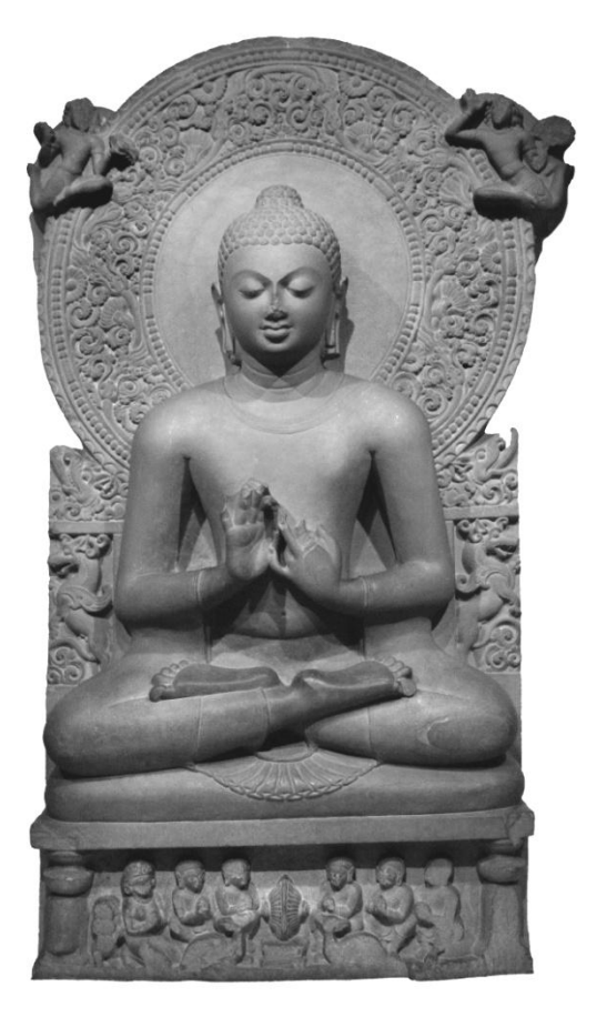
Figure 3.2 Turning the Wheel of Dharma

The relief shows the seated Buddha with his hands in the gesture of setting in motion the wheel of Dharma. Below the Buddha in the centre is the wheel of Dharma, with an antelope on each side, reflecting the location of the first sermon at the Mṛgadāva. The wheel is surrounded by the first five disciples, who listen with respectfully raised hands.