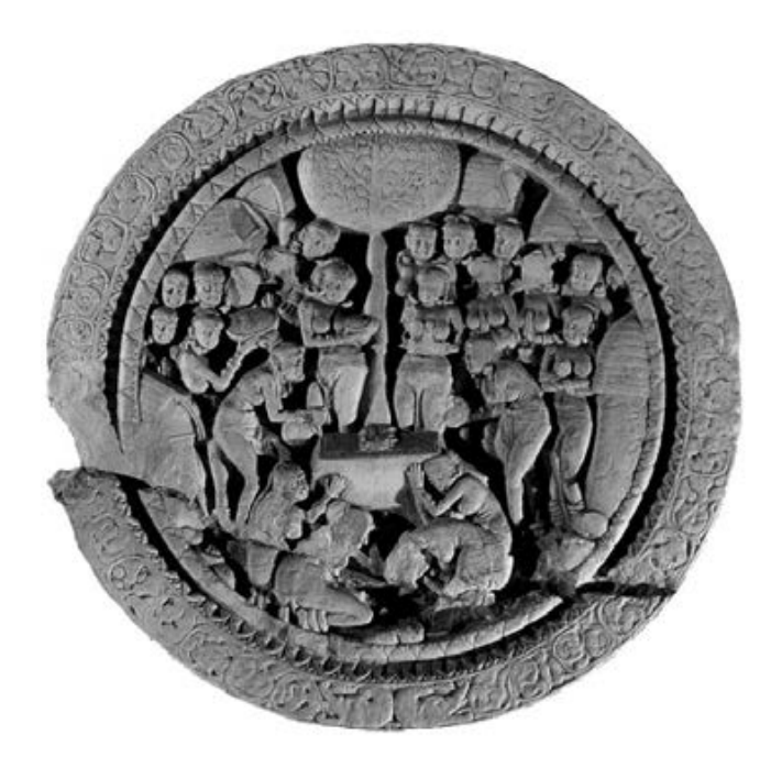
Figure 4.1 Sujātā's Offering

The medallion shows Sujātā offering food to the bodhisattva Gautama, represented by his seat under the tree of awakening.