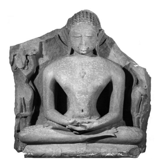
Figure 3.3. Jain Tīrthankara

Indian setting, a claim to omniscient knowledge was made by the leader of the Jains. <sup>90</sup> The Buddhist texts reflect awareness of such a claim. <sup>91</sup>