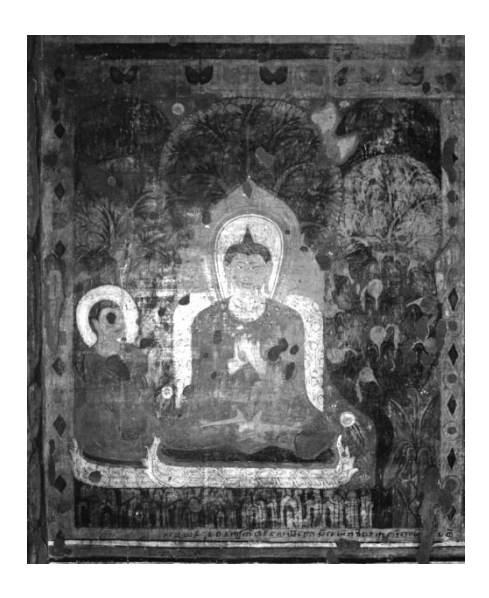
Figure 4.3 The Transmission of the Abhidhamma to Sāriputta

According to the inscription that accompanies the painting, the scene depicts the Buddha teaching the Abhidhamma to Sāriputta, passing on to his chief disciple what he had just taught to the devas in the Heaven of the Thirty-three.