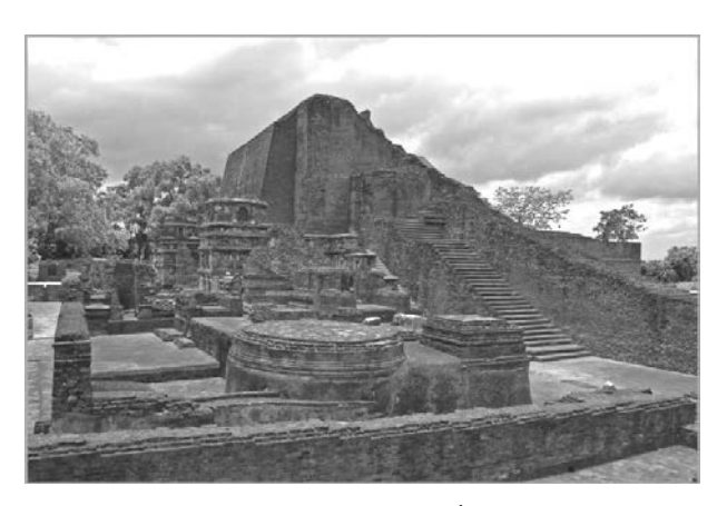
Figure 3.1 The Stūpa of Śāriputra

The report in the Anupada-sutta that Sāriputta determined the mental states of each absorption one by one endows the Abhidharma approach to analysis with the prestigious authority of having been the actual form of meditation practice undertaken by the disciple whom the early tradition reckoned as outstanding for his wisdom.<sup>44</sup>