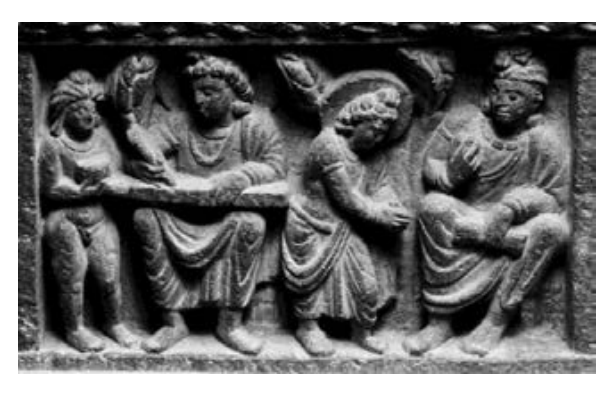
Figure 1.1 Siddhārtha Learns Writing

the drawing up of more complex lists. Although writing has certainly exerted an important influence on Abhidharma literature, <sup>34</sup> the initial stages of development with which I am concerned here still take place within a predominantly oral culture. <sup>35</sup>