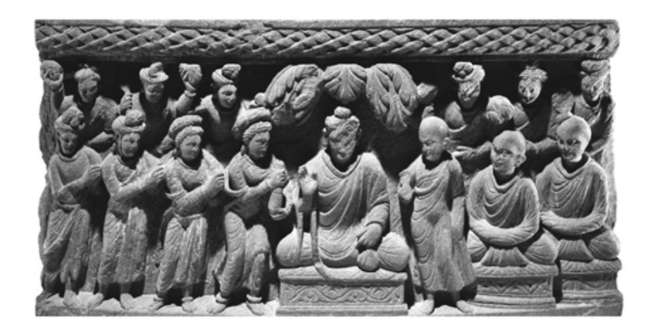
Figure 2.2 Mahāprajāpatī Requests Ordination

Only the Saṃmitīya Vinaya takes up a related case, prohibiting a nun from asking a monk difficult questions.<sup>73</sup> Thus the Abhidharma is not mentioned in any of the Vinaya versions of this particular principle to be respected.