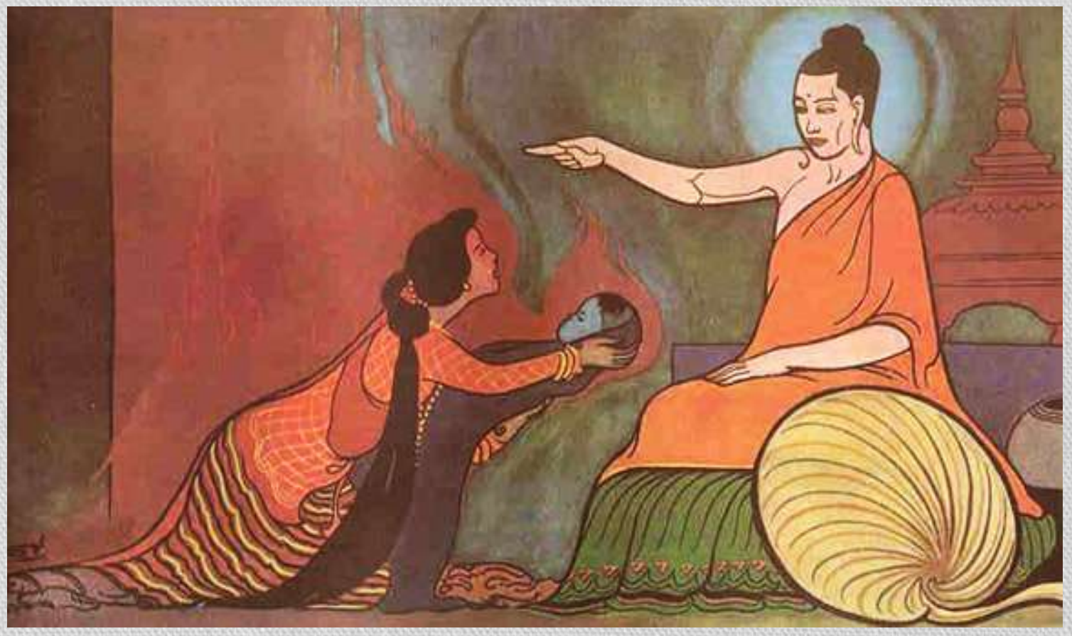
(From Illustrated History of Buddhism, Young Men's Buddhist Association, Burma, 1951)

"Who can count those who have died here?"