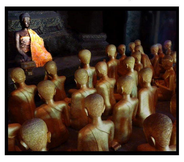
Figure 1 Nuns Facing Mahāpajāpatī Gotamī<sup>29</sup>

Then the Blessed One addressed Nandaka: "Well then, Nandaka, tomorrow you should instruct the nuns with the same instruction. The venerable Nandaka assented: "It is well, venerable sir." 28