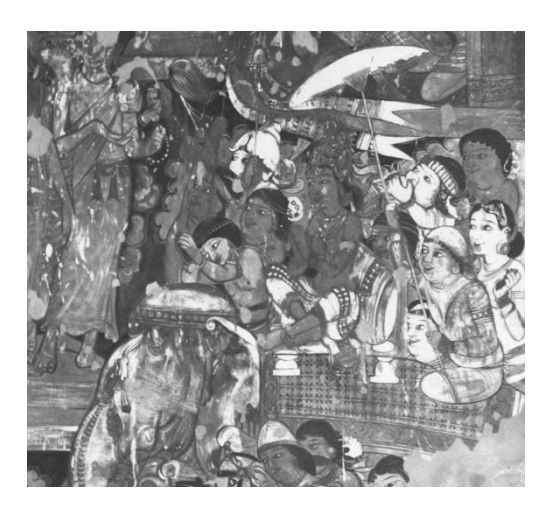
Figure 5 The Nun Utpalavarṇā as a Wheel-turning King<sup>55</sup>

The main point made with this listing is not that a woman cannot fill any of these roles in a future birth. Instead, the point is only that she cannot occupy any of these leadership roles in the present. To do so, at least in a patriarchal society like ancient India, one would have to be a male.<sup>56</sup> In other words, this list reflects ancient Indian notions about social hierarchy.<sup>57</sup>