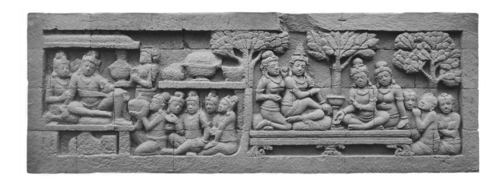
Figure 4 Men and Women in a Royal Household<sup>11</sup>

Nuances of protection also seem to underlie the simile of a household with many women and few men, which in most versions of the foundation account forms part of the Buddha's reply to Ānanda's intervention. I will study this simile in more detail in the next chapter as part of several illustrations of the repercussions of founding an order of nuns.