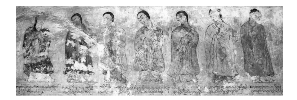
Figure 6 Outstanding Nuns<sup>19</sup>

The abilities and accomplishments of nuns are highlighted in several early Buddhist discourses. Two Pāli discourses present Khemā and Uppalavaṇṇā as the models other nuns should emulate. Parallels in the Ekottarika-āgama and the Mahāvastu agree with this presentation, thereas a Sanskrit fragment counterpart instead presents Mahāprajāpatī Gautamī together with the same Utpalavarṇā as the models for other nuns. Thus the different listings agree in placing a spotlight on Utpalavarṇā, who in the listing of outstanding disciples receives praise for her abilities in supernormal powers.